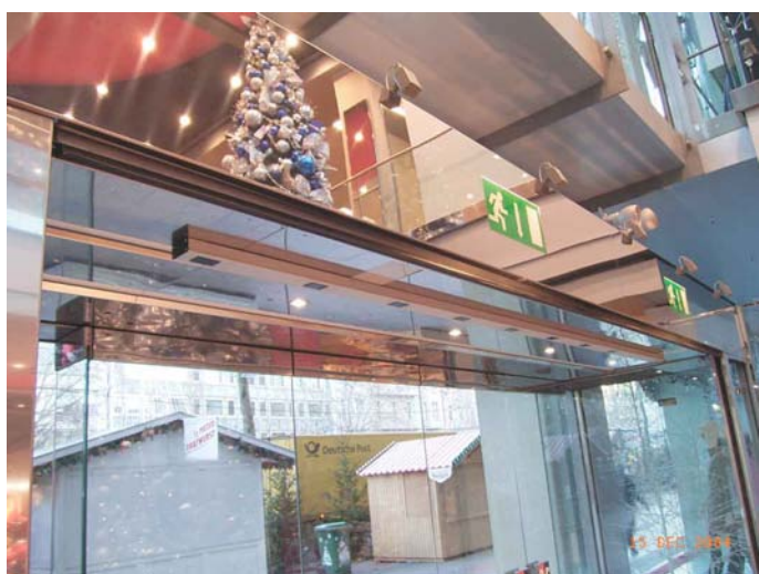
Sensors installed in an entrance area.

Specially developed active infrared sensors installed above the doors detect bidirectional all people, entering and leaving. Due to the combination of the measuring points, the counting system is able to recognise the direction of the passing people. According to the width of the door, one or several sensors are installed next to each other. Even a crowd of people will be individualised and counted with a high accuracy.