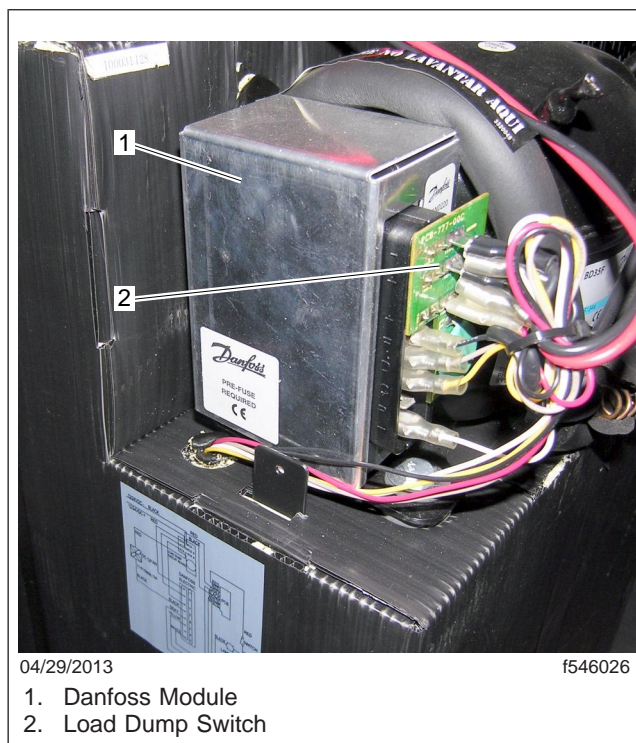
Fig. 2, Load Dump Switch Location