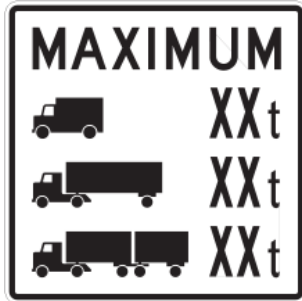
restricted weight sign